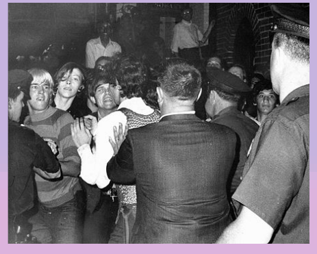
Stonewall Riots

Though police raids on gay bars were common in the 1960s, on June 28, 1969, patrons of New York's Stonewall Inn said, "enough." They fought back, riots broke out, and supporters poured into West Village, igniting the gay rights movement in the U.S. Within six months, two gay activist organizations were formed in NewYork, and three newspapers were launched for gays and lesbians.