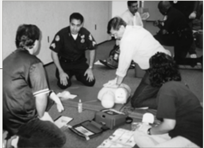
LIFEWORX: Court officers learn how to use defibrillator during a class on lifesaving techniques.