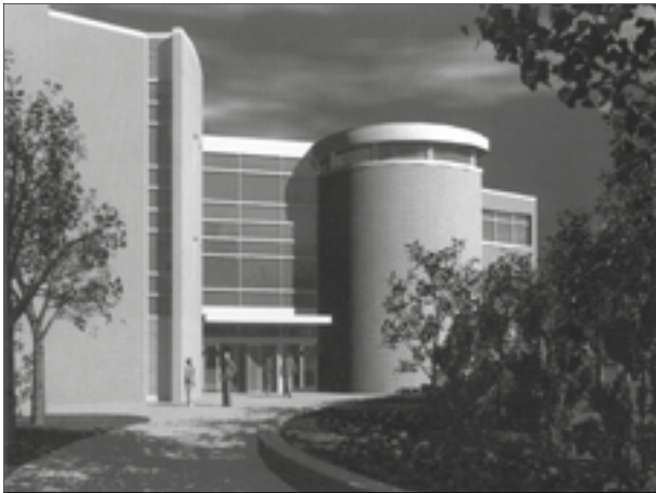
Architect's rendering of the New York Judicial Institute, which is scheduled to open late next year on the campus of the Pace University School of Law in White Plains.