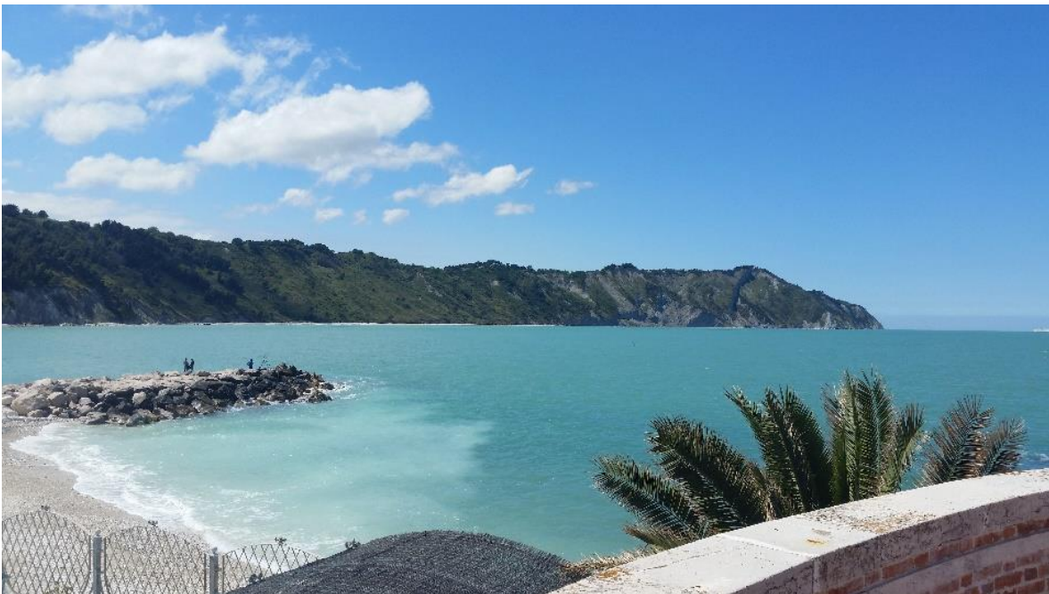
Figure 2. The Adriatic Ocean from hotel in Portonovo Italy (May 2019)