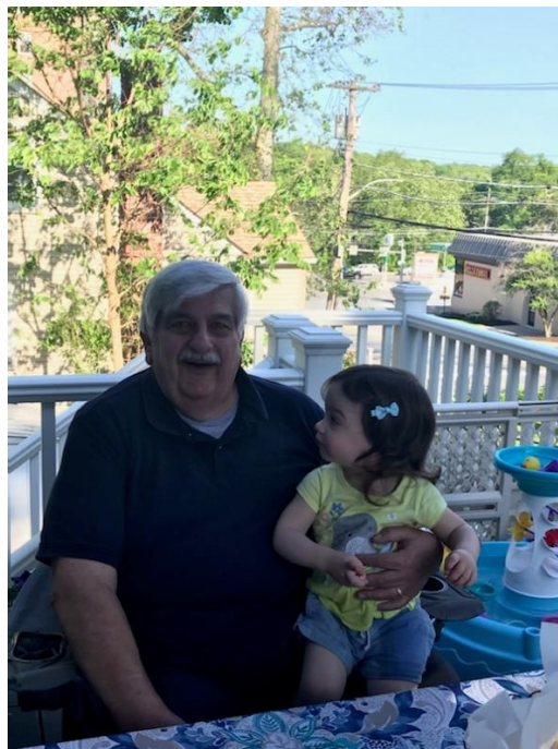
Figure 1 With Granddaughter in May 2020 - their first reunion in 10 weeks